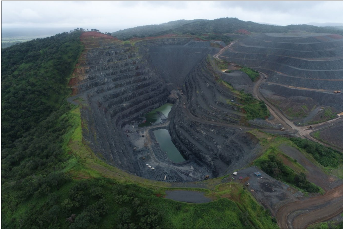
Figure 1: View of Mako Pit in September