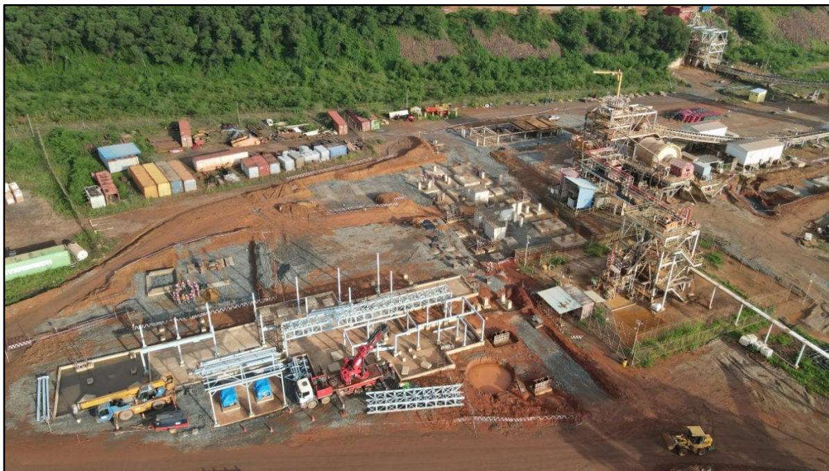
Figure 3: Ball mill and flotation area foundations

The project remains on track. Detailed engineering for all disciplines as well as the manufacture of the long lead items is complete.