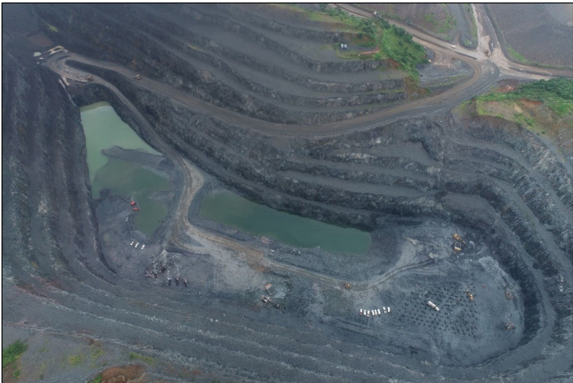
Figure 2: Inundation of lower areas where higher grades of the orebody are located